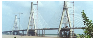
Semi-actively controlled bridge Dong-Ting, China

Develop structural control methods for civil engineering structures taking into account the exact vibrational properties which depend on the thermal state